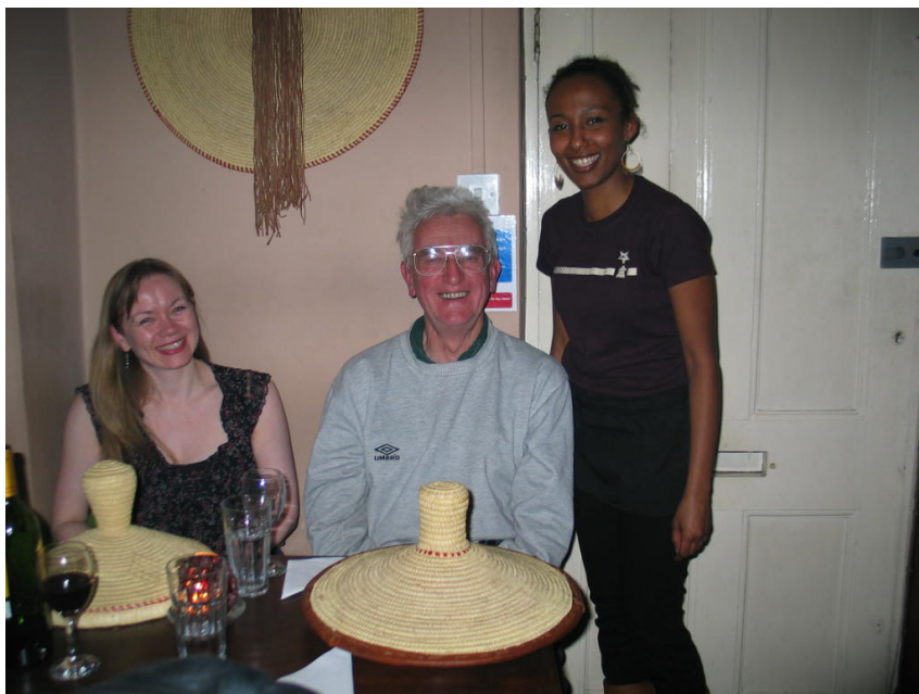
At the Mosob Reataurant