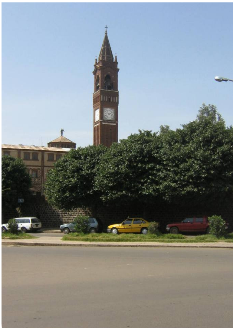
The Cathedral, Asmara—Arsiema Berhane