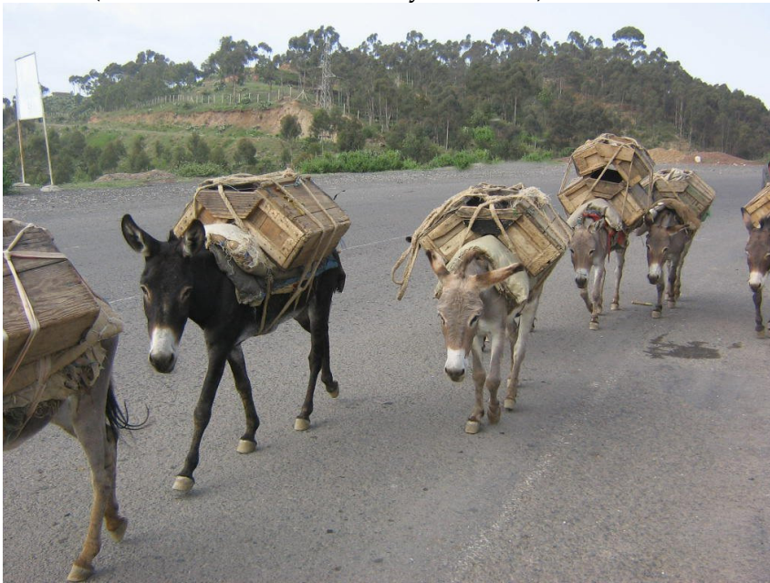
Donkeys near Asmara—Arsiema Berhane

Zuria (hooded dress as worn by women ) = Zuria